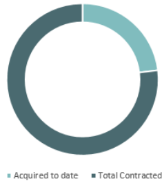
Photo Acquisition # to Completion

Tourism Nanaimo continues to build digital assets. To date, Tourism Nanaimo has acquired 42 photos for Tourism Nanaimo and tourism stakeholder use. A further 51 photos are available for Tourism Nanaimo use only.